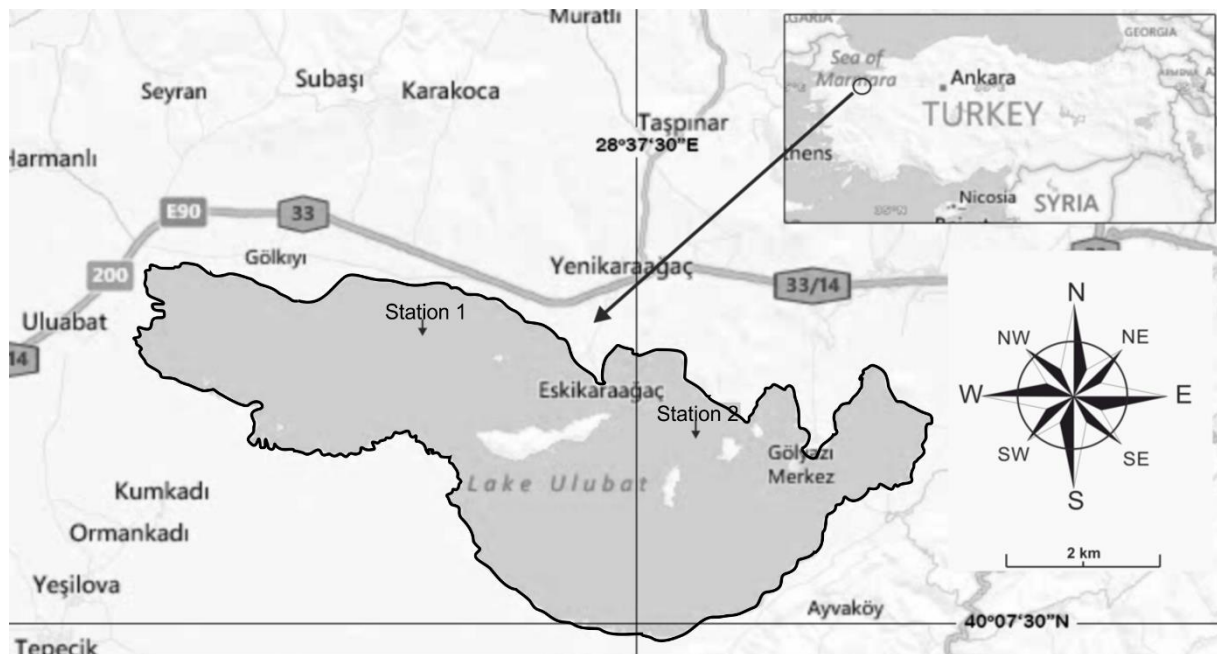
Figure 1: Study area and sampling locations

SELECT ( Share Each Lengthclass Catch Total ) method was used for determining selectivity (Millar, 1992; Millar and Fryer, 1999; Millar and Holst, 1997).