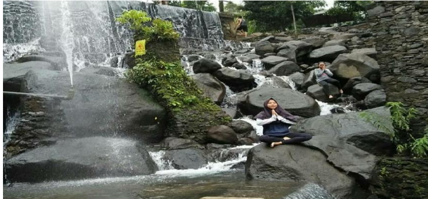
Figure 2: Cijanun Stone Park Purwakarta

Article 3 paragraph 1 of Purwakarta Regency Regulation No. 10 of 2009 specifies that one of the local government concerns of Purwakarta Regency that may be presented to the village government is the tourist sector, which is further described in the appendix to the Regulations. The section describing the types of tourism-related matters that can be submitted to the village includes 1) management of tourist objects in the village outside the tourism master plan, 2) management of recreation and public entertainment areas in the village, 3) recommendation for granting a tourist lodge permit, and 4) assistance with hotel and restaurant tax collection in the village. In other words, the village administration has the power to develop and expand the tourist industry in villages with tourism potential (Payne 2022). This is also a kind of village autonomy reform intended to increase the efficacy and efficiency of the implementation of village autonomy to empower communities and enhance social welfare. According to this Regional Regulation, the Cipendeuy Village Government has the right to construct and administer physical items. This tour of Cijanun Spring Park has become a local asset. Coronavirus 2019 (Covid-19) is caused by a coronavirus 2 that causes severe acute respiratory illness (SARS-CoV2) (Setiyowati et al. 2022).