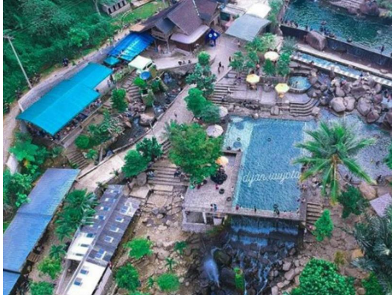
Figure 3: Cijanun Stone Park Purwakarta

are particularly significant, especially the Purwakarta-Jakarta, Purwakarta-Bandung, and Purwakarta-Bandung routes Purwakarta-Cirebon Typically, Jakartans traveling to Bandung choose to bypass toll highways and use the Purwakarta-Cirebon route to go through the Purwakarta Regency before reaching their objective in the city of Bandung (Meng., 2022). There are three leading tourism categories in Purwakarta Regency, namely religious tourism, educational tourism, and natural tourism. As shown in the table above, natural tourism is owned by Purwakarta Regency in a relatively large number, namely as many as 12 tourist destinations, indicating that Purwakarta Regency has promising natural tourism potential. In addition, because the drilling process is carried out using generator power, it causes air pollution that can interfere with the respiratory system (respiratory inorganics) (Rosyidah, Andiyan, et al. 2022).