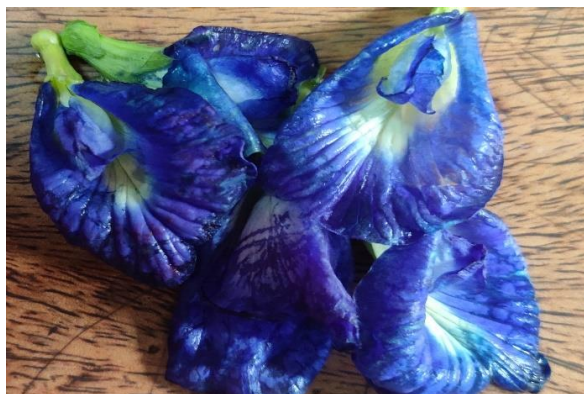
Image 1 Fresh Clitoria ternatea