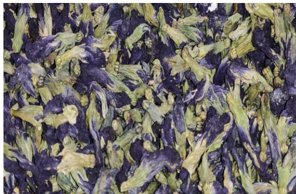
Image 2 Dried Clitoria ternatea