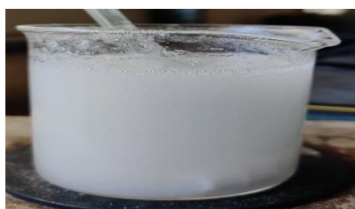
Image 3 Clitoria ternatea gel formulation

The 0.6ml of Clitoria ternatea extract (active drug) was dissolved in 15 ml of glycerin with the aid of mild heat (solution A). Weighed amount of HPMC K100M and Carbopol 934 were dispersed in 75 ml of distilled water. The mixture was stirred continuously by using magnetic stirrer for around 30-45min; until uniform suspension obtained to prevent no lump in the dispersion. Propylparaben was added in it (solution B). Now, Solution A was added into the solution B and mixed thoroughly with constant stirring and homogeneous dispersion was obtained. For the neutralization of the gelling agents, dropwise 10 % sodium hydroxide solution was added in it up to gel get formed. Finally, the required quantity of distilled water was added at room temperature to make up the volume of gel upto 100ml and formulation were evaluated 14 .