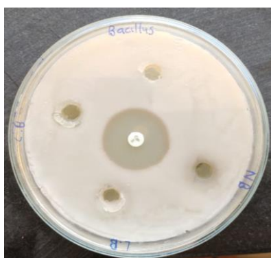
Antimicrobial Activity of Bacillus spp.