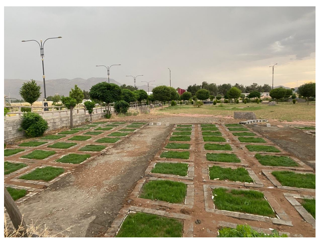
Fig(3) lawn growth