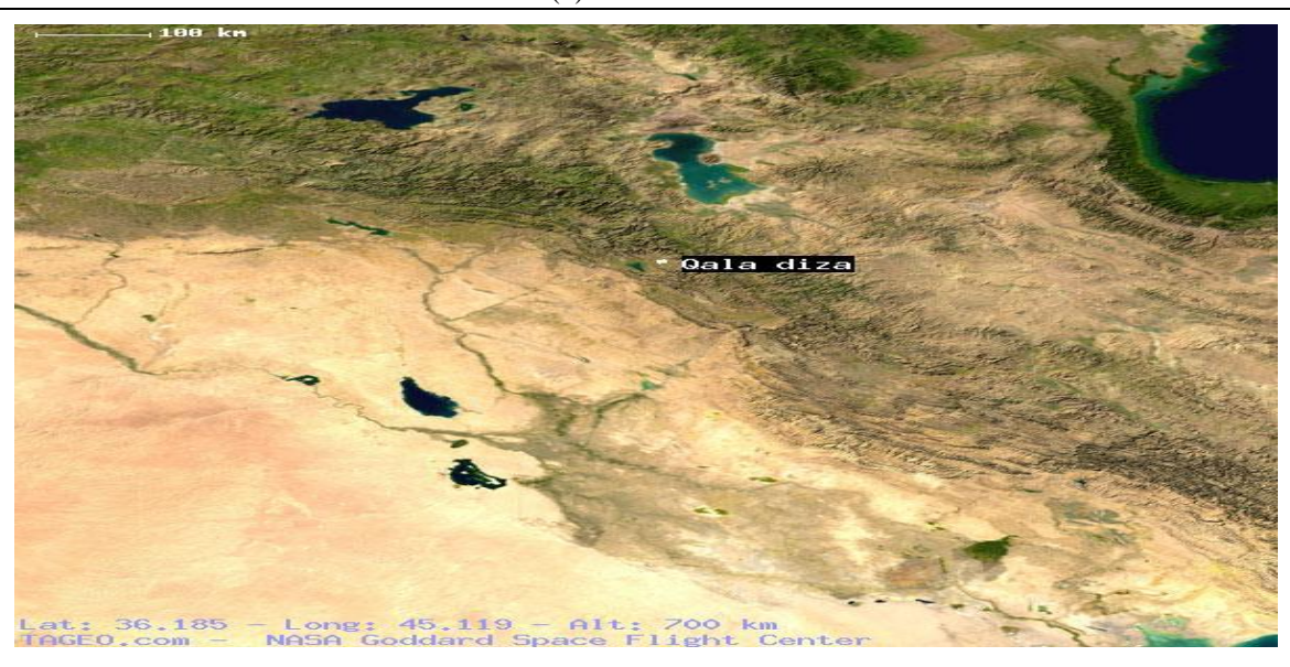
It was carried out at University of Raparen, field well as of the college of Agriculture, Pishdar Region, located in Sulaimani province, during the two

seasons fall and spring, from the April 2021 to October 2022. The seed that used is four types 40% Festuca arundinacea , 10% Poa pratensis , 40% Festuca arundinacea , 10% lolium perenne . The maximum and minimum temperature and humidity for the experiment location are records