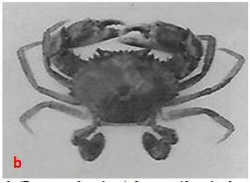
Figure 2: a) Freshwater crab ( Potamon ebonyicum ) b) Crab ( Scylla spp. )

Crab rings are effective in water, and should be operated from a boat or pier. They lay flat in the water, creating basket that funnels crab to the bottom. Minimum size requirement for crabs are specified for every aquatic