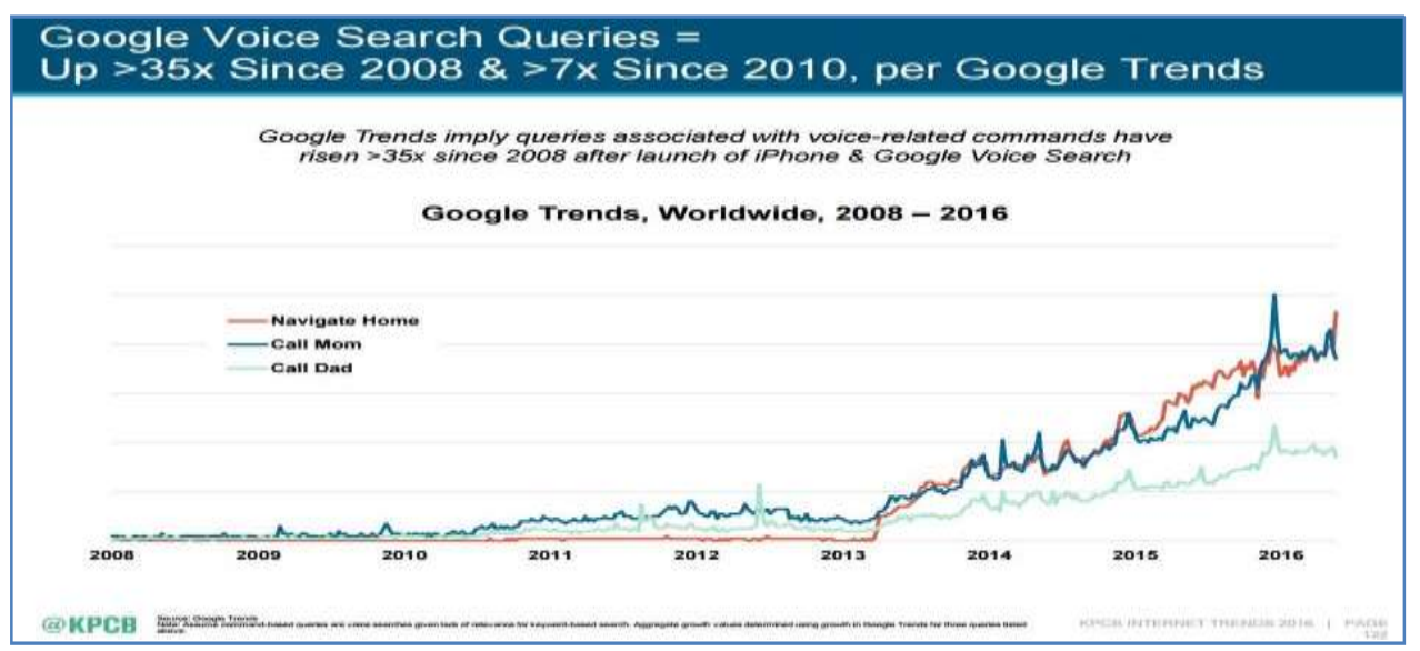
Voice-activated search is mobile, and you use mobile devices on a daily basis

Voice-based search is becoming more mobile-friendly and locally focused as it becomes more integrated into mobile applications and devices. Numerous digital assistants are now included into items that you use on a daily basis, both at work and at home.