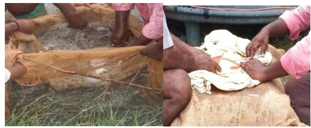
Selection of brooders

Temperature : Natural environmental temperature influences the maturation of individual male and female and breeding of fishes. The presence of optimum temperature ranges and critical limits, beyond which fish won't reproduce, is a consistent finding. Warm temperatures play a central role in stimulating gonadal maturation and accelerating spermiation in many fish species. This suggests that temperature directly impacts gonads and indirectly affects their responsiveness to pituitary gland stimulation, consequently influencing the gonadotropin synthesis and their release. For Indian major carps, it's noted that their breeding occurs in the temperature range of 24°C to 37°C, with the best temperature being around 27°C (Chaudhary 1968). Breeding success diminishes significantly beyond 30°C.