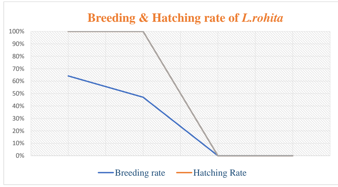
Graph: -Breeding and Hatching rate

Induced breeding of Labeo rohita (Rohu) using ovatide, a synthetic hormone preparation, has shown positive results in enhancing spawning. The breeding rate is around ~80% and the fertilization rate is ~90%.