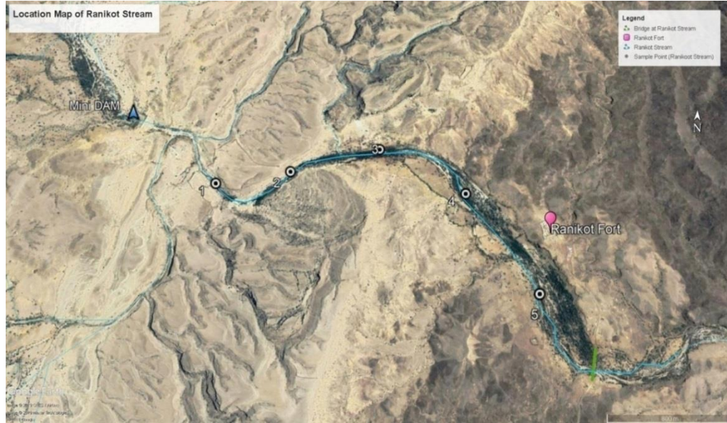
Figure 1: Map showing collection site area Ranikot Stream, Sindh-Pakistan.

was measured as space linking the front and later rims of eye in the longitudinal alignment were measured in the same way systematically.