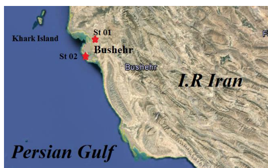
Figure 1: The studied area in Bushehr province, Persian Gulf.

Water temperature and pH were recorded by using Hach multiparameters model HQ40d and salinity was recorded with an Atago S/Mill refractometer. Water samples for analysis of heavy metals have been collected by using 2-L Hydro-Bios Ruttner sampler and fixed with concentrated Nitric acid. Heavy metals (Hg and Pb) concentrations were measured by Voltammetric method, using Metrohm 797 VA computrace polarograph according to Metrohm Application Bulletin (2005). TSS sampling and analysis has been done based on AHPA (2005) Method.