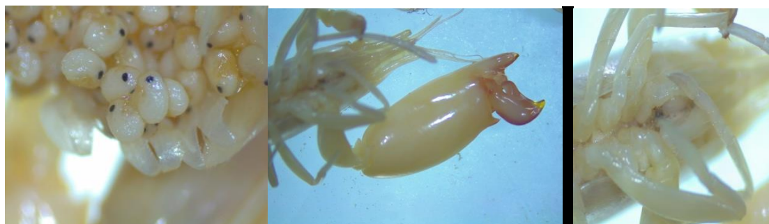
Fig3. Synalpheus africanus . (C). Ovigorous female, Lateral view (D). Anterior carapace, lateral view (E)