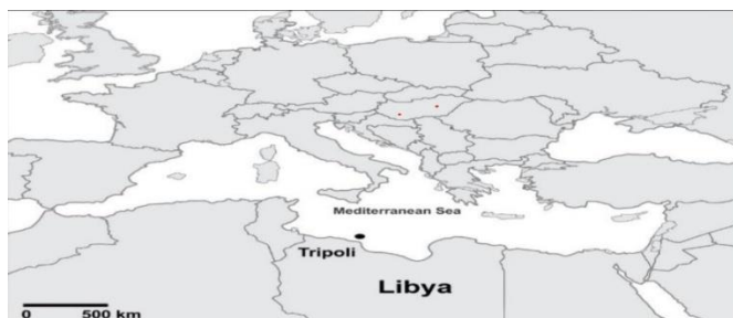
Fig.1. Location where Synalpheus africanus specimens were collected in Tripoli, Libyan waters

Arthropoda, Subphylum: Crustacea, Class: Malacostraca, Order: Decapoda, Family: Alpheidae, Genus: Synalpheus , Species: Synalpheus africanus The specimens collected were mostly males and 16 oviparous females. (Fig.3C,D,E)