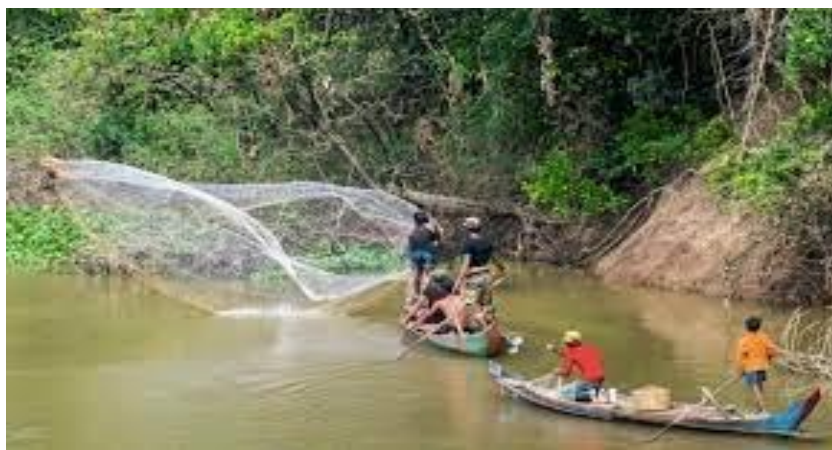
Figure 1: Showing Inland fisheries practice

With this background, in the current review we aimed to describe and delineate on the potential impacts of climate change on Inland fisheries and its economic implications.