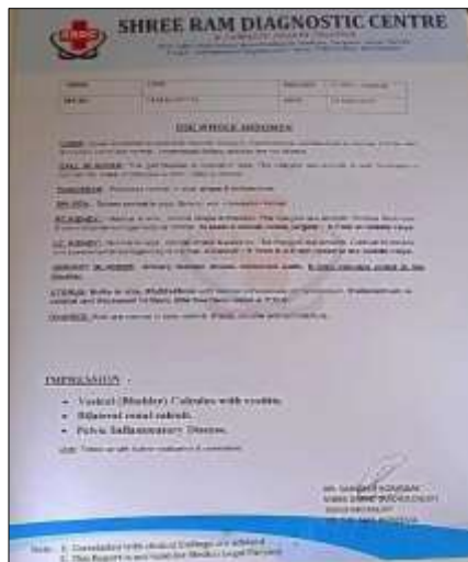
Fig.2: USG before treatment

After taking a detailed case taking, repertorisation Sepia 200 /1 dose stat was prescribed followed by Hedeoma mother tincture 10drops in half cup water stirred well to be taken thrice daily every 6 hourly for 3 days in first visit [13] . Sepia covers maximum symptoms with marked intensity but the colic and dysuria along with intermittent retention of urine was very pronounced hence considering organ specific action of Hedeoma, it was prescribed to relieve dysuria and pain. [13][14] . On 22/05/2021 VAS score for renal colic was 9 and VAS score for 10.