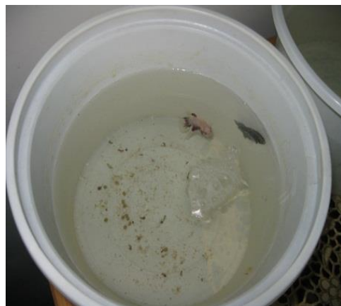
Figure 1: Fighter fish reproduction, bobble nest is seen on the water surface.