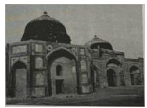
Figure No. 5: Humayun Mosque, Fatehabad

Humayun Mosque, Fatehabad, About fifty metres south-west of the Idgah and Firoz Shahi column enclosure, the mosque is located near the Purana Qiia police station. Because Humayun worshipped there while passing through the town, this mosque's name is derived from this incident. It's a modest structure with three dome-shaped rooms that are all connected to one another as shown in figure 5. In comparison to the other chambers, the central one is a bit larger and features a massive dome. While the inside was originally plastered, the facade of the central bay and the niches on the eastern wall were embellished with brickwork and a little quantity of glazed tile. Turquoise and cobalt blue glazes were used to create designs on the tiles. A four-centered profile can be deduced from the engravings of the domes.