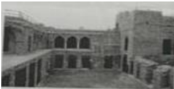
Figure I: Dhosi Hill Fort

Asigarh Fort was built in the 12th century for Ajmer and Delhi ruler Prithviraj Chauhan, according to history as shown in figure 2. It is also regarded as one of India's most formidable and impenetrable forts. This is evident from the enormous construction and hefty walls. If you're a history buff, you must see this magnificent fort.