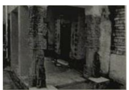
Figure 10: Gujjar-Kheri

The Sonipat district village of Gujjar-Kheri, a modern looking village temple has given various architectural elements that date from the early mediaeval period as shown in figure 9. The temple sits atop a mound, and a nearby pond is thought to be extremely old.