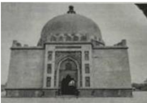
Figure 8: Hafiz Jantala Tomb