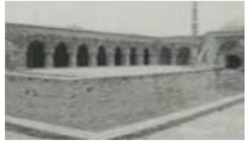
Figure No. 3: Madhogarh Fort