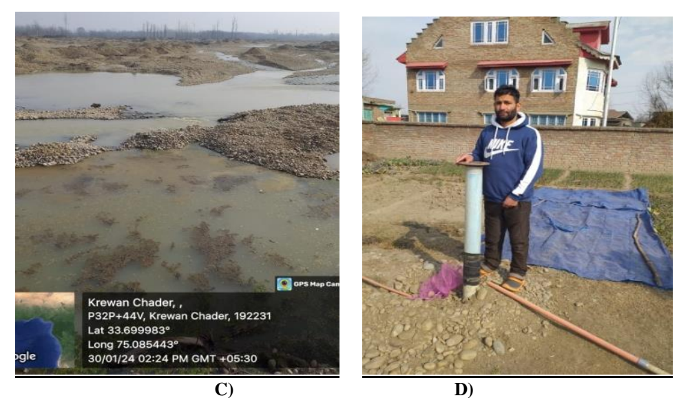
Fig 2. A-D taken from different locations of river vishaw show dip in water level.