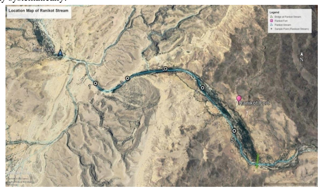
Figure 1: Map showing collection site area Ranikot Stream, Sindh-Pakistan.

was measured as space linking the front and later rims of eye in the longitudinal alignment were measured in the same way systematically.