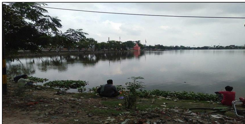
Fig. 1. Pollution of Harahi Pokhar Pond with floating animal carcass