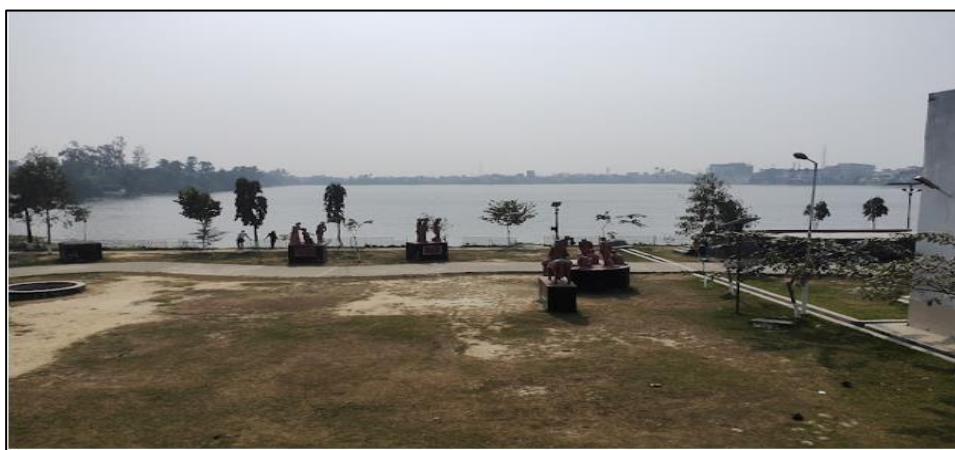
Fig. 2. Dighi pond at a glance