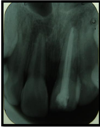
Figure 7: Apexification and obturation irt 21

The patient did not come for further follow up appointments and reported to our clinic after 11 months with discoloration in relation to 21. (Figure 8)