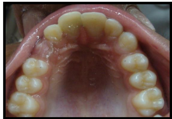
Figure 12a: post-operative (labial)