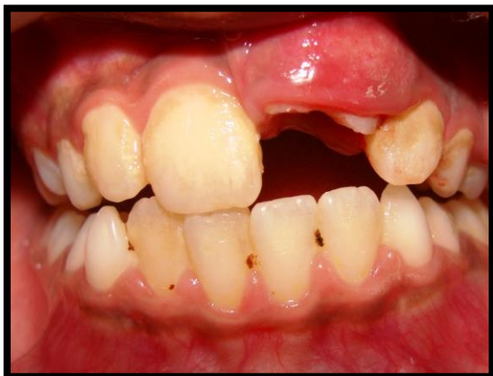
Figure 1: Swelling in labial mucosa of 21

A 12-year-old boy was brought to the outpatient department by his parents with the chief complaint of swelling and fracture of upper left front tooth due to a fall in the playground. The parents of the patient reported to the hospital within half an hour of injury. On extra-oral examination shows no abnormality was detected. Intra-oral examination revealed swelling in relation to the labial mucosa of 21. The concerned tooth (21) presented with Ellis type II fracture, no mobility and the entire coronal portion of the tooth was embedded in the socket which coincided with the diagnosis of severe intrusion (Figure 1 & Figure 2).