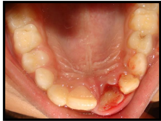
Figure 2: Coronal portion of 21 embedded in the socket

For Radiographic evaluation, IOPA (intra-oral periapical radiography) was done with respect to 11 and 21. IOPA revealed incomplete apex formation in relation to 21 with a normal periodontal ligament space.