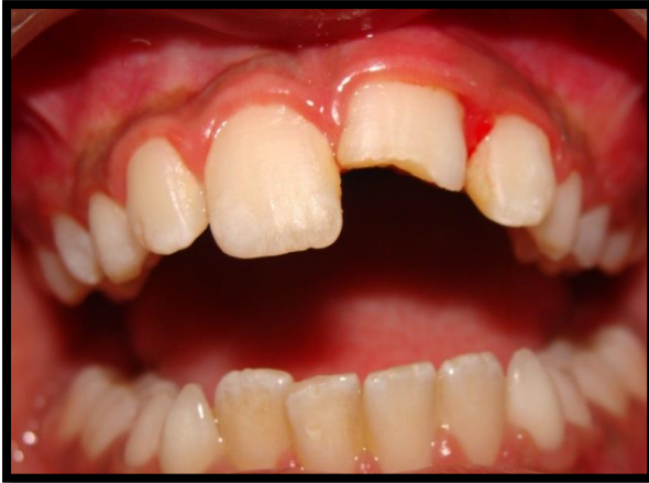
Figure 4: 4 weeks after trauma

1/3rd of the tooth was erupted in the oral cavity (Figure 4).