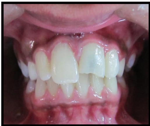
Figure 8: Discoloration irt 21

The patient did not come for further follow up appointments and reported to our clinic after 11 months with discoloration in relation to 21. (Figure 8)