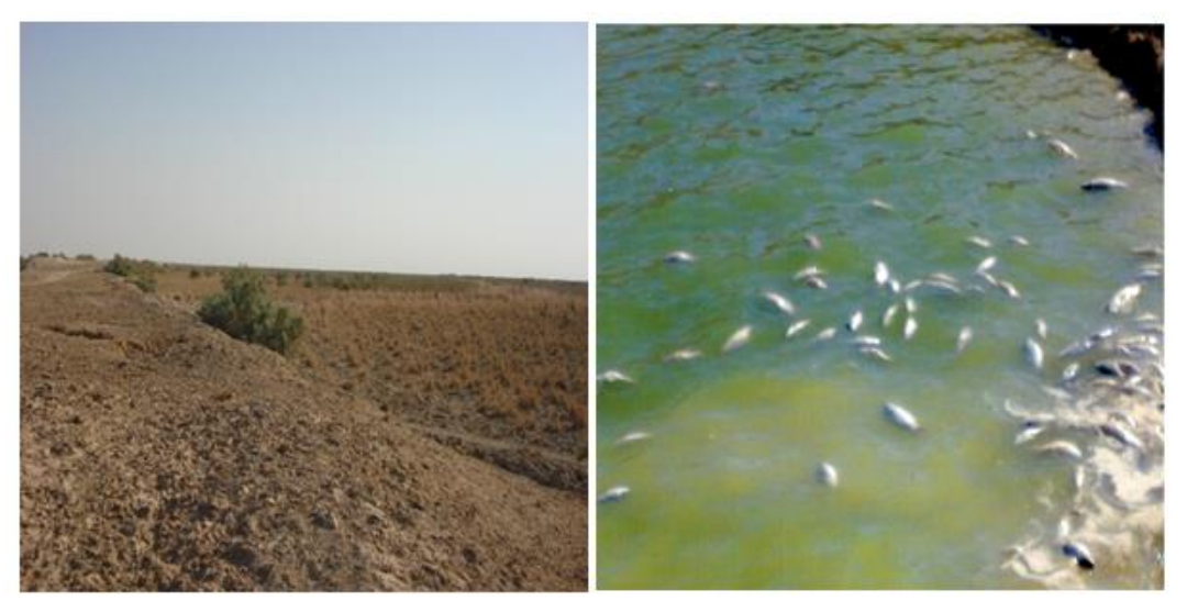
Figure 2: Impacts of salinity increase on freshwater fish farms in Basra City.

The less impacted are marine fisheries which is affected by human interventions. Synergistic interactions occurred between current stressors. fishing including and ecosystem resilience, and the abilities of marine and aquatic organisms to adapt and evolve according to climatic changes. Roessig et al. (2004) called for increased research on the physiology and ecology of marine and estuarine fishes, particularly in the tropics. Effects of climate change on fresh water systems will occur through increased water temperature, decreased oxygen levels and the increased toxicity of pollutants. In addition, it was concluded that altered hydrological regimes and increased groundwater temperatures would impact on fish communities in lotic systems. In lentic eutrophication systems could be exacerbated and stratification becomes more pronounced with a consequent impact on food webs and habitat availability and quality.