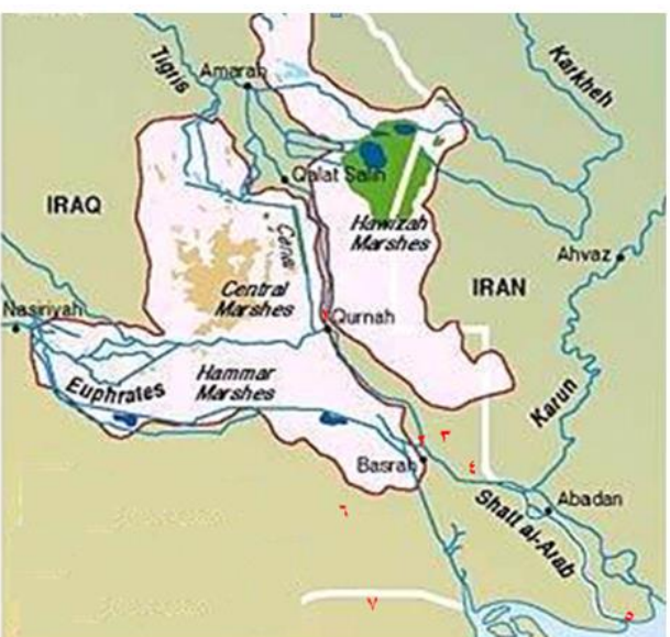
Figure 1: The aquatic ecoststem of southern Iraq.

The aquatic ecosystem of Southern Iraq comprises of vast area of wetlands locally called Marshes. They include Huwaizah marsh, Central marshes and Hammar marsh. It includes the Shatt Al-Arab estuary which flows into the Gulf (Fig. 1).