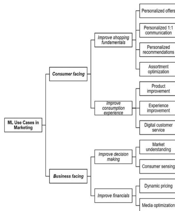
Figure 2. Machine Learning use in Marketing [28]

This 2nd class is involved with the reports clients have whilst utilizing items or services and the moves they take as a result. It includes improvements to the goods, the user enjoy, and virtual customer service. Remarkable improvements in this discipline are being made by way of internet of factors (IoT) technology primarily based on AI, especially in the regions of product creation, product help, and client dating management. Groups may additionally gain get entry to to internet-based totally devices and accumulate exact statistics on how clients use the product in actual time. As a result, it permits an extra information of clients, permitting companies to create better goods and raise the patron fee [29]. As an instance, the home automation commercial enterprise June created a "do-it-all oven" that combines seven exclusive home equipment into one. With using machine learning and PC imaginative and prescient technology, it is able to be capable of apprehend and prepare food and propose a