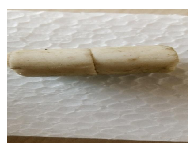
Fig 2: Ceramic Ring and Bio ball