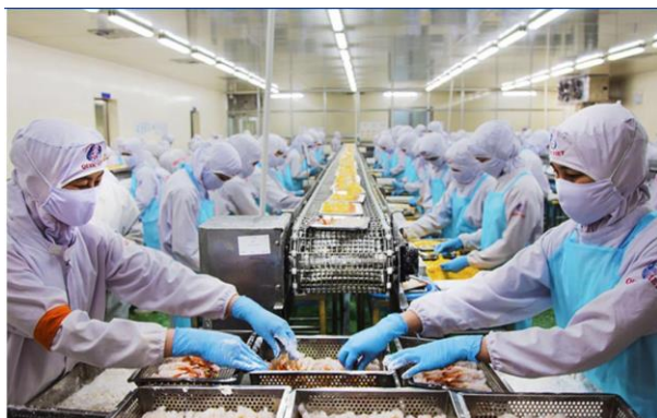
Figure 2- Ca Mau export markets expanded and free FTA

well as enhance bank roles (NN Thach et al, 2021; LT Hue et al, 2020; NN Thach et al, 2020).