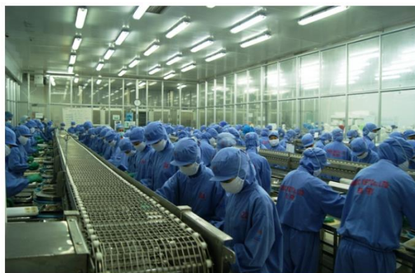
Figure 1 - production lines in Ca Mau firms