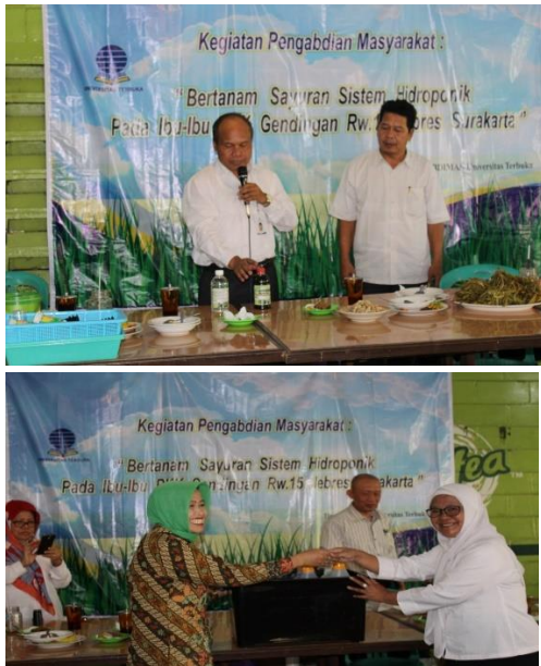
Figure 2 Community Service Activities

The training implementation process runs for four months, from August to November. The method used is the lecture method, demonstrations and direct practice.